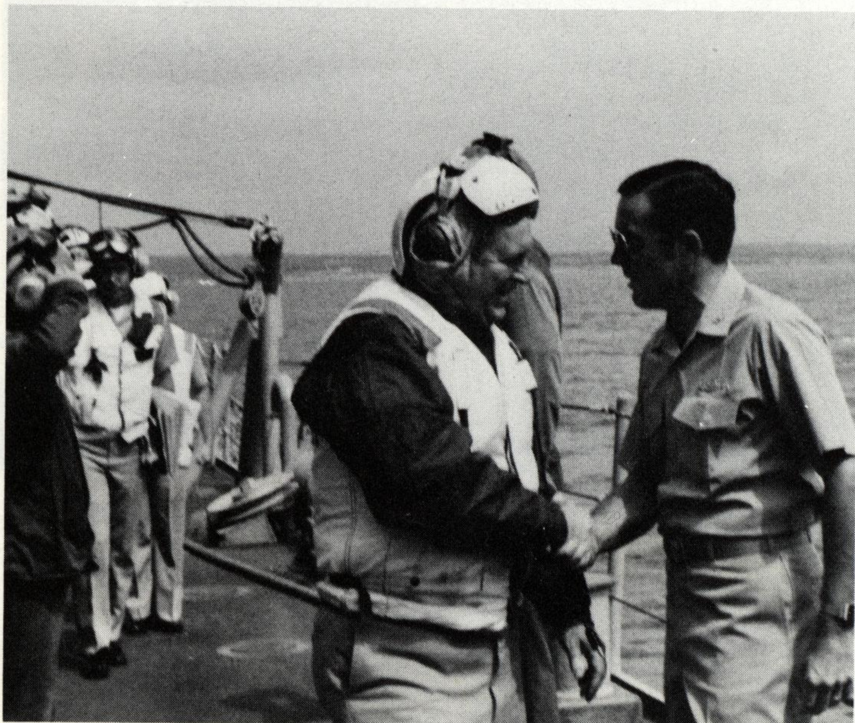
One of his favorite jobs, reenlisting a crewmember.