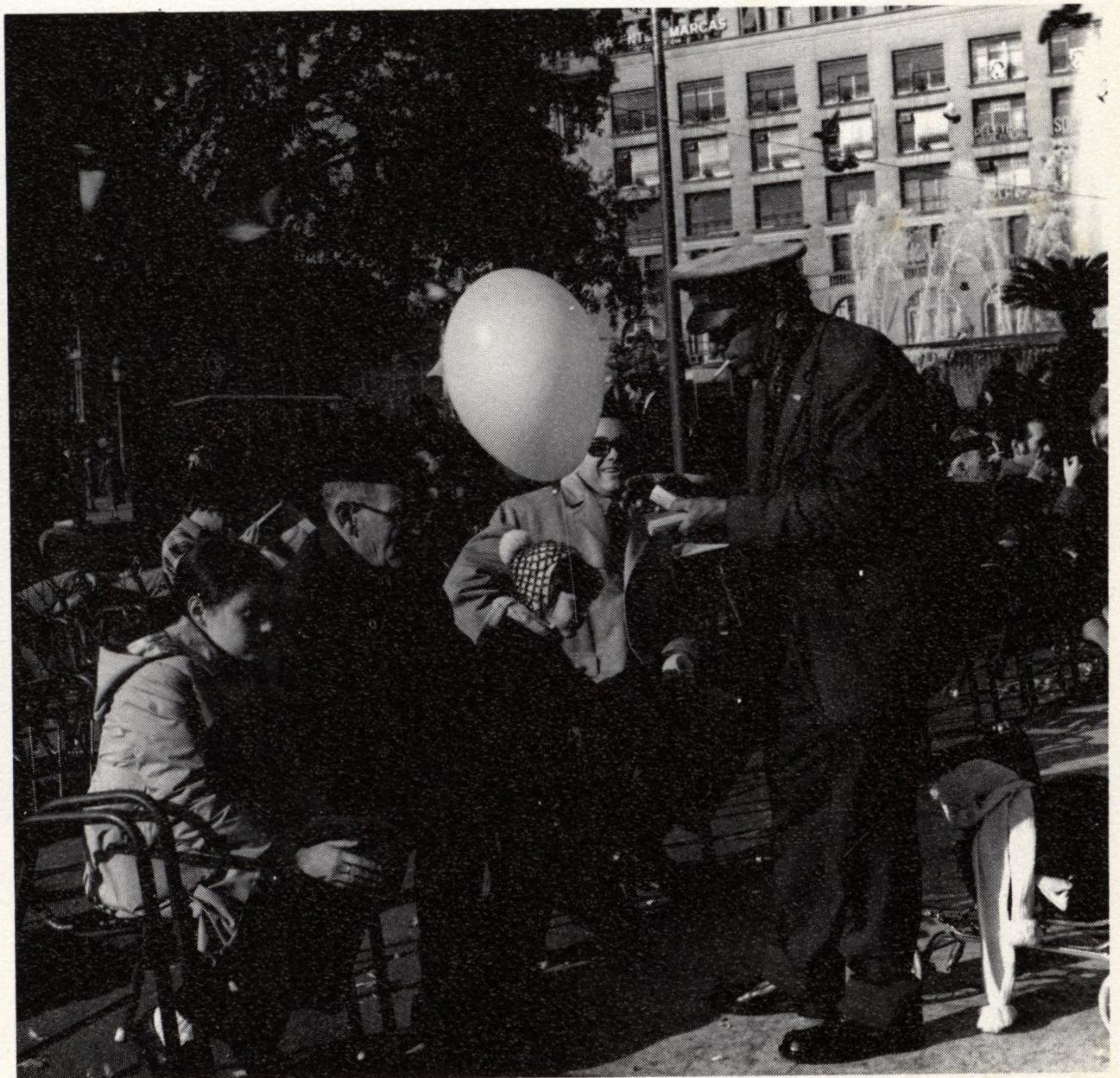
Get those lottery tickets while they're hot!