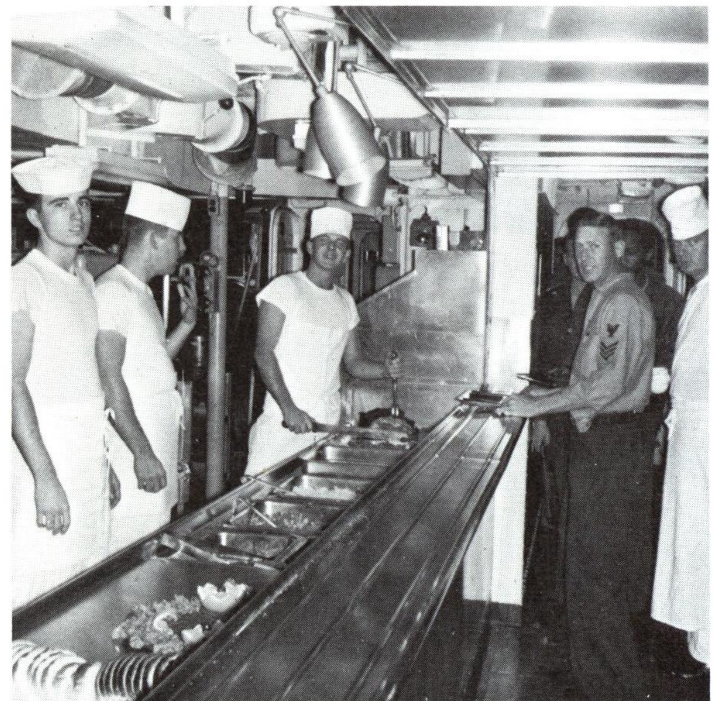
You shoot it - we cook it.