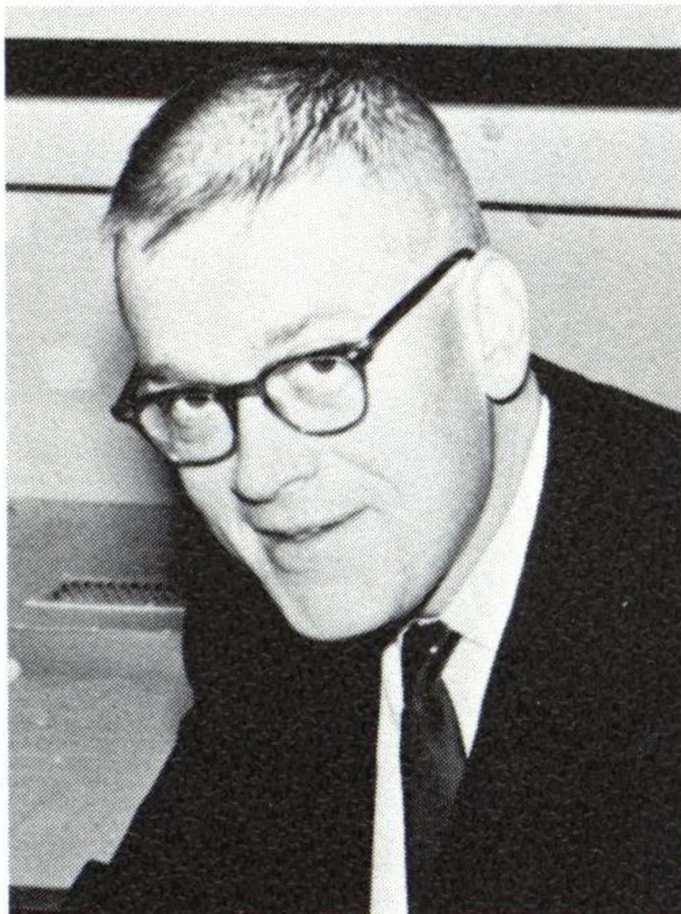
LT GENDER OPERATIONS