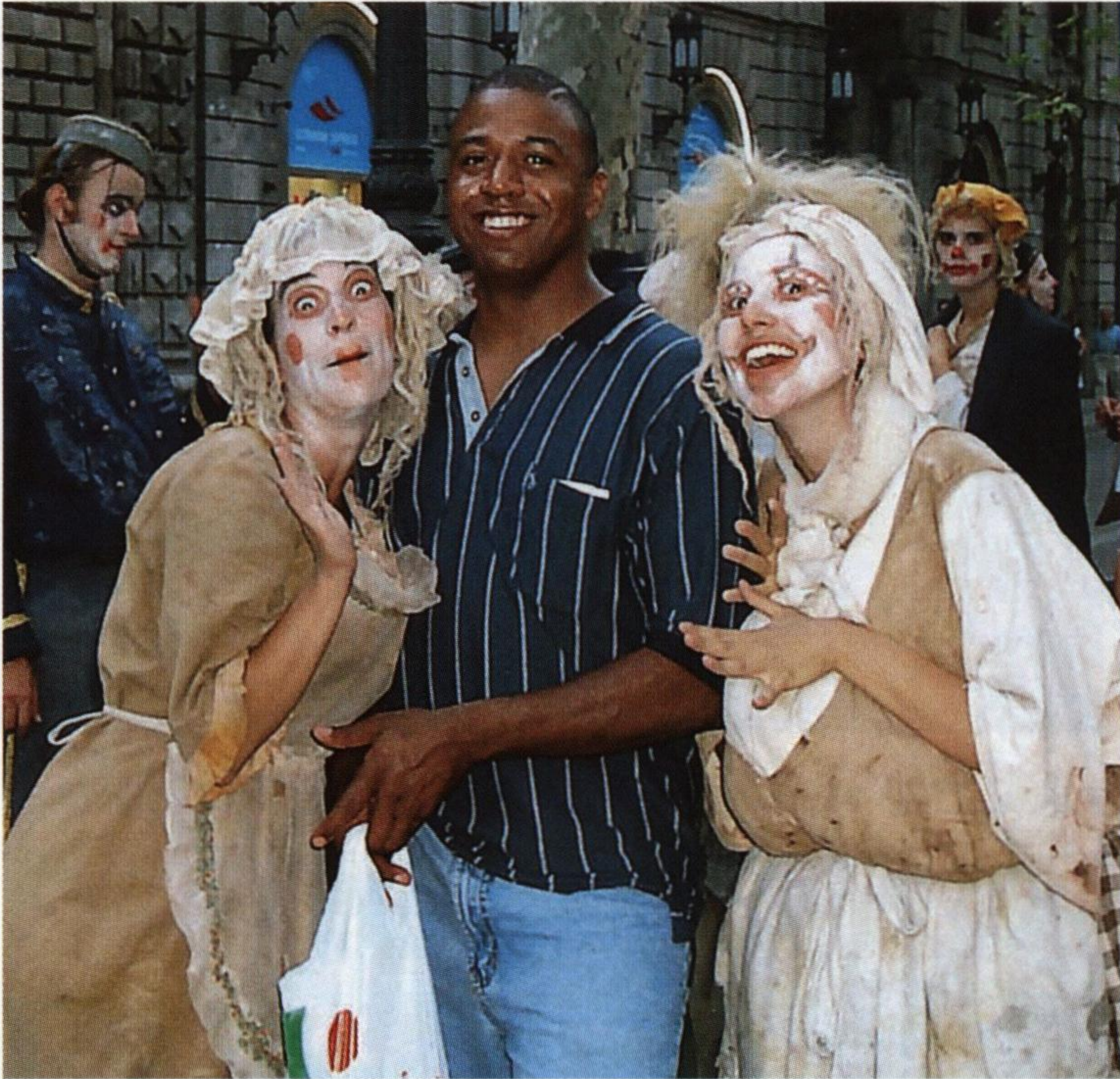
Above: GSEC Newton smiles with the street vendors in Spain.