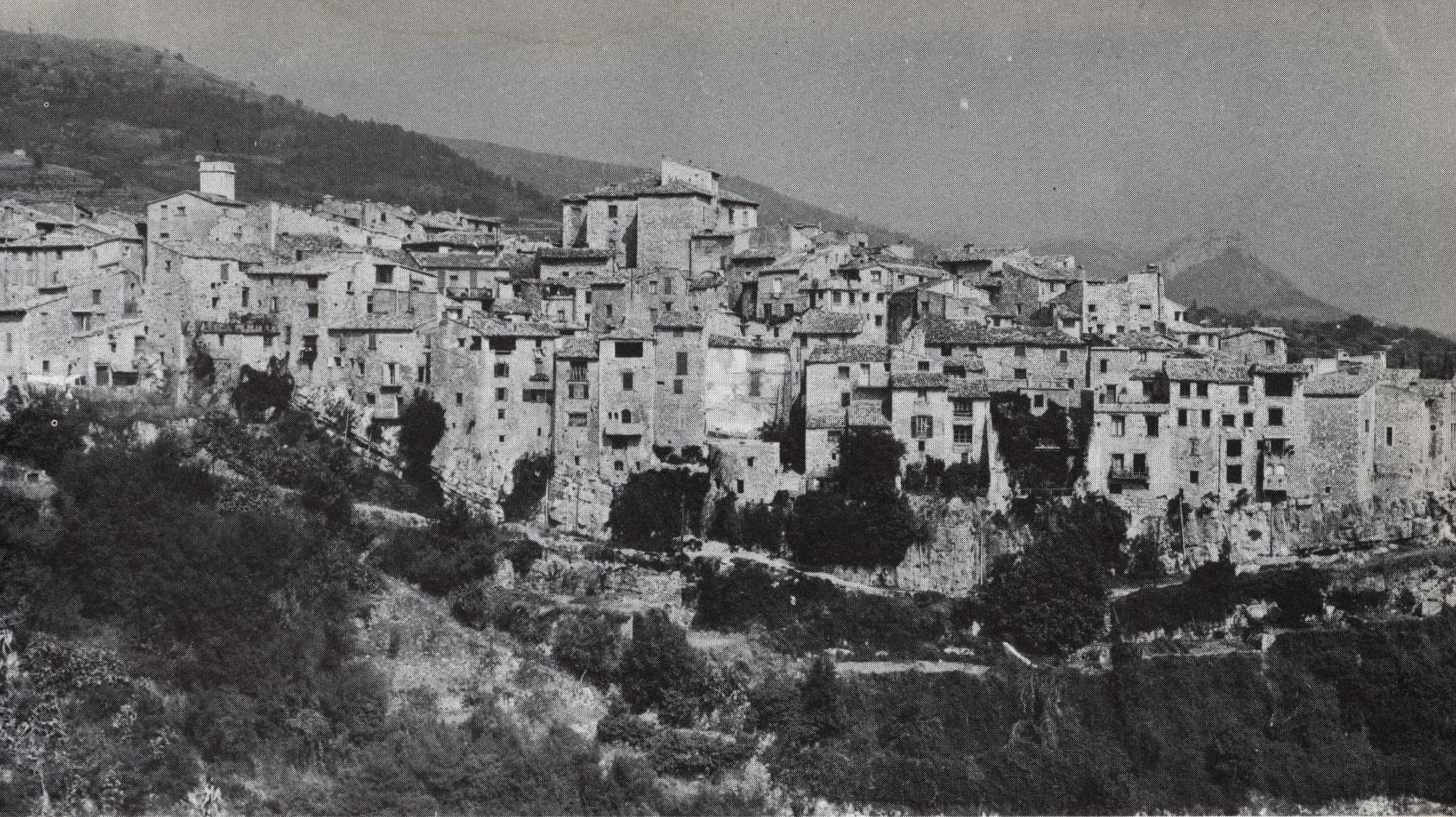
A French Alpine Village.