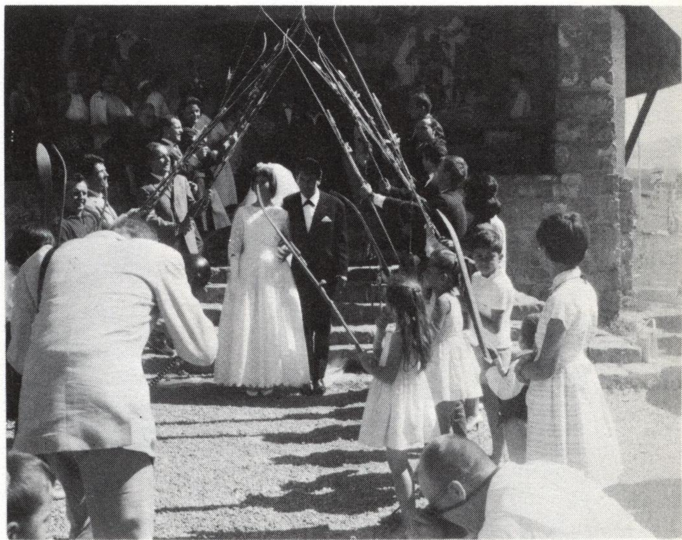
Alpine Wedding with arch of skis.