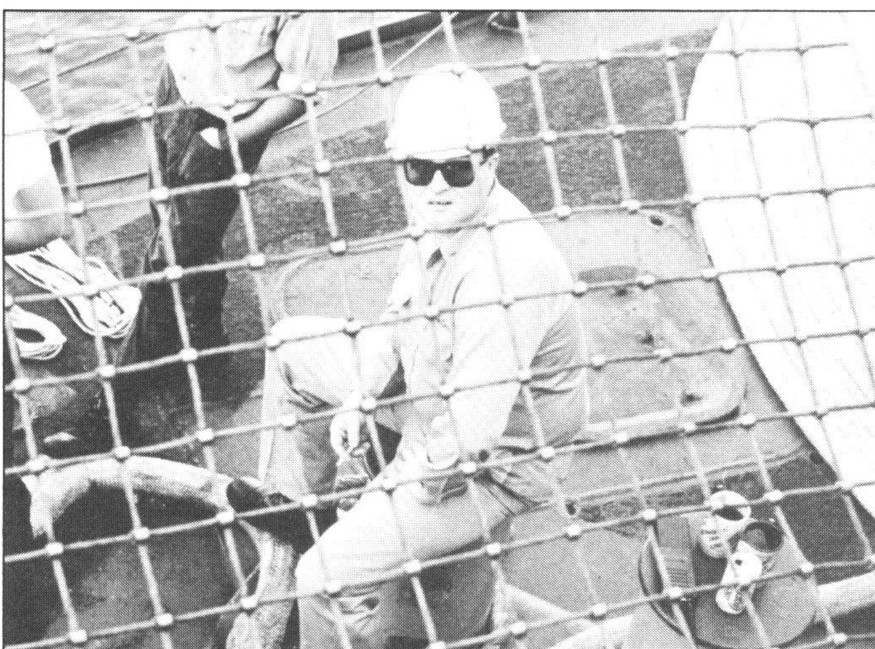
Deck is responsible for maintaining the ship's 118 lifeboats and nearly 1,000 CO2 lifejackets.