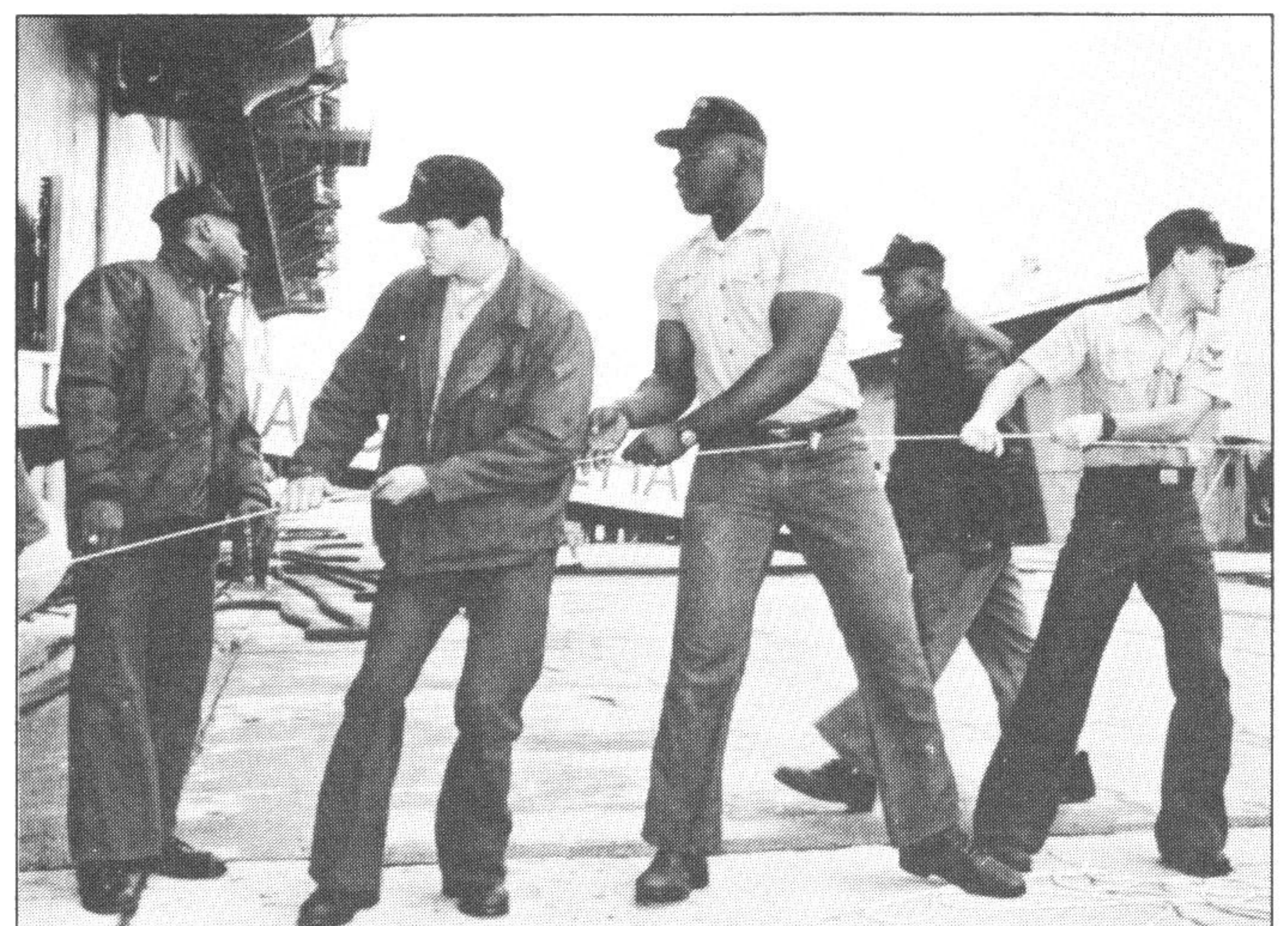
Deck's boatswain's mates supervise all linehandling working parties and are responsible for maintaining all ship's boats.