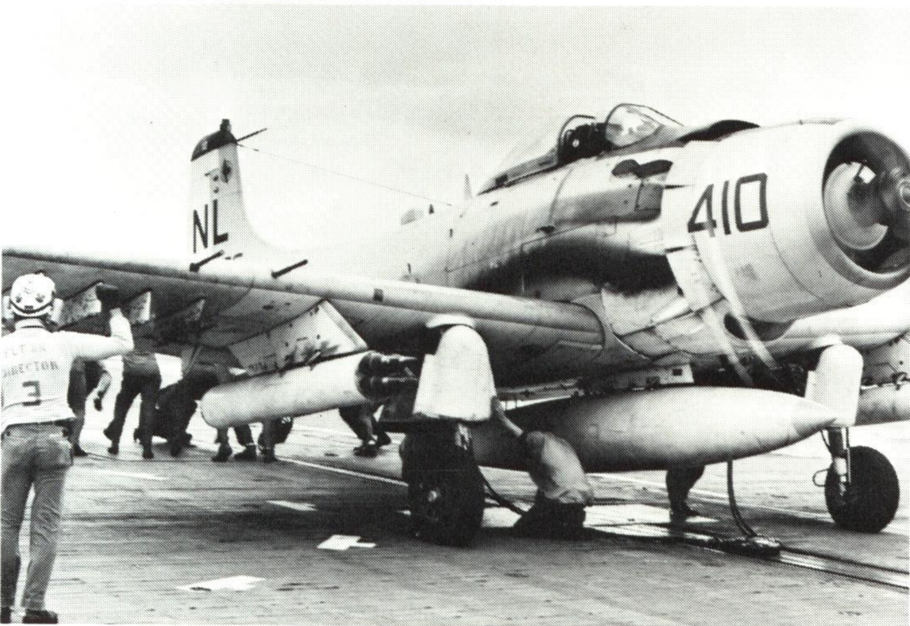
The Spad on the cat ready to return to the Coral Sea

Hornet's disappointed pilots awaited the 103,000th . . . .